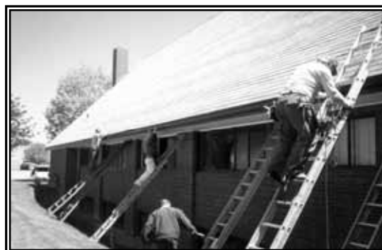
Raising the roof!