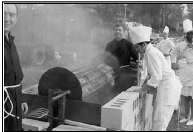
Barbecued pig at the first Monks' cell