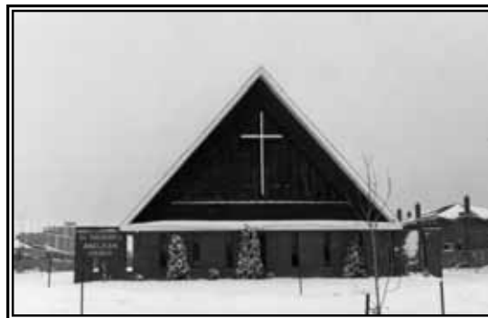
Before the renovation