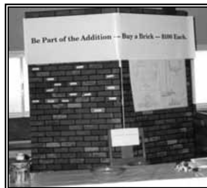
Raising the funds