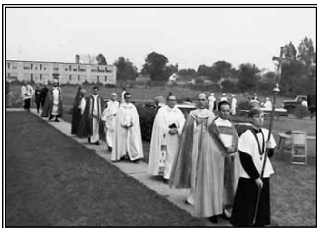
Celebrating the 1300th anniversary of Theodore's elevation to the See of Canterbury (Sept. 22, 1968)