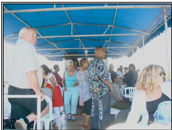
Salsa dancing on Lake Ontario